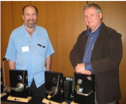
Hager Hardware booth