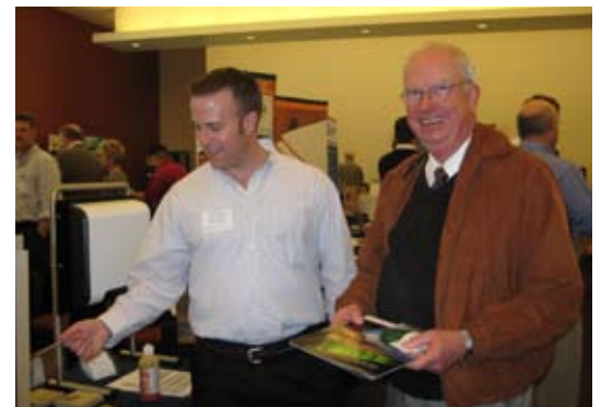
R.E. Edwards booth