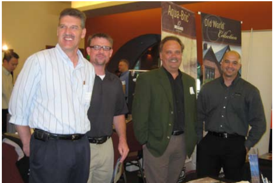
Oldcastle Glass booth